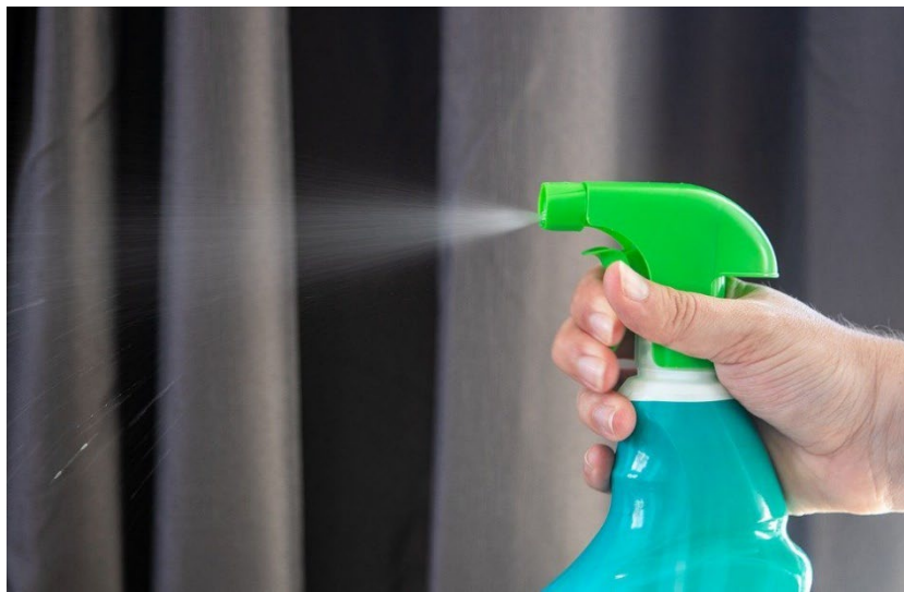
Fig 2. Example of a trigger spray typically used for cleaning products

This conceptual framework was applied to a case study. The product in this case study is a general-purpose cleaning (GPC) spray (fig 2.) for hard surfaces. Typically, such a product is used for cleaning hard surfaces such as worktops, tables and small items around the home and may also be used in bathrooms to clean sinks, toilets (outer surfaces), baths and showers. The product contains a consortium of multiple Bacillus species selected for their cleaning efficacy. The total concentration of the microbial spores in the product is 1 \times 10^7 CFU/ml.